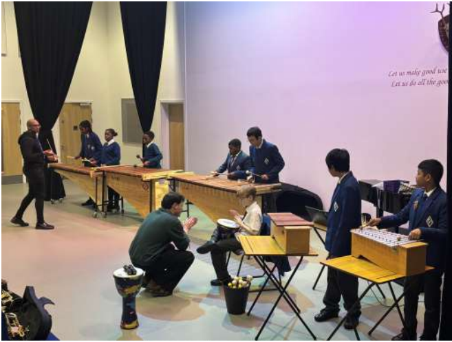
January: Music Rehearsals