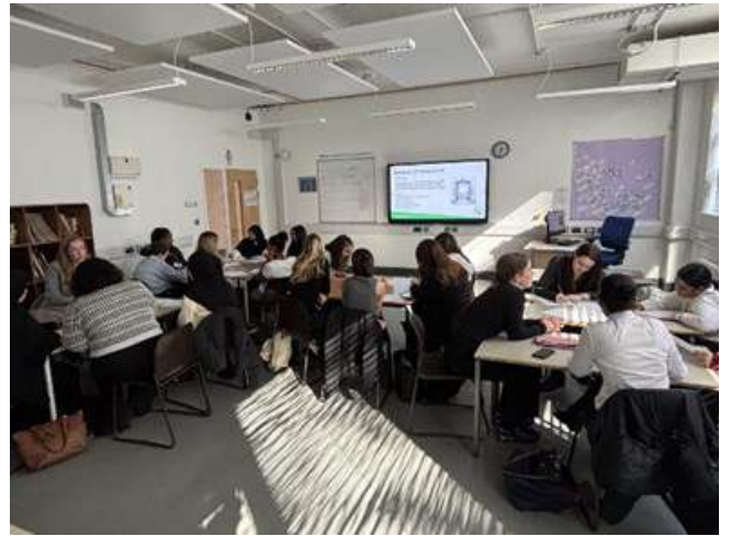
March: The Girls' Network