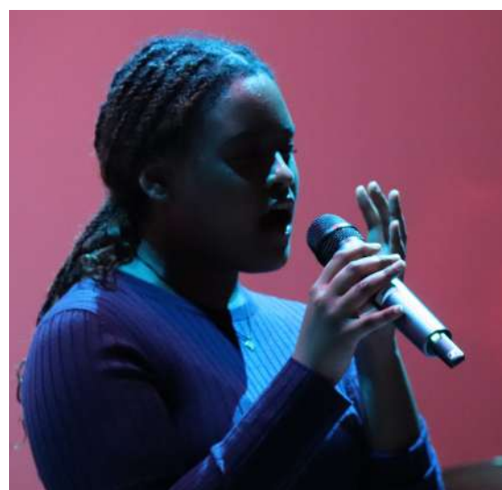
Maria Fidelis Talent Show 2026