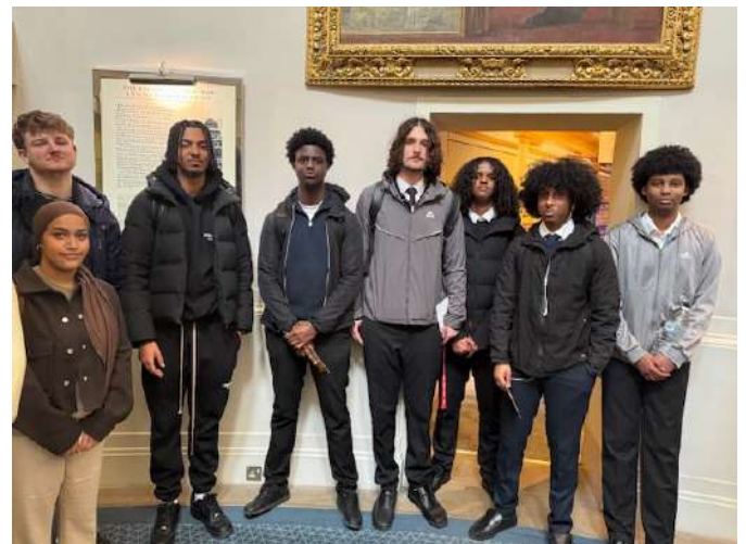
March: Bank of England Visit