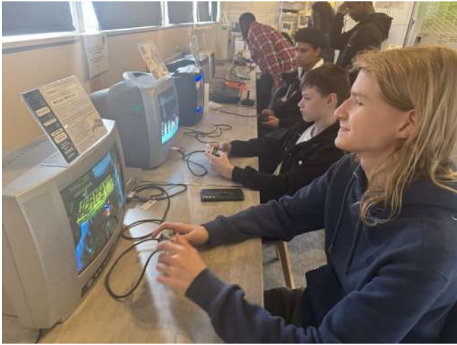
March: Exploring Retro Games Consoles