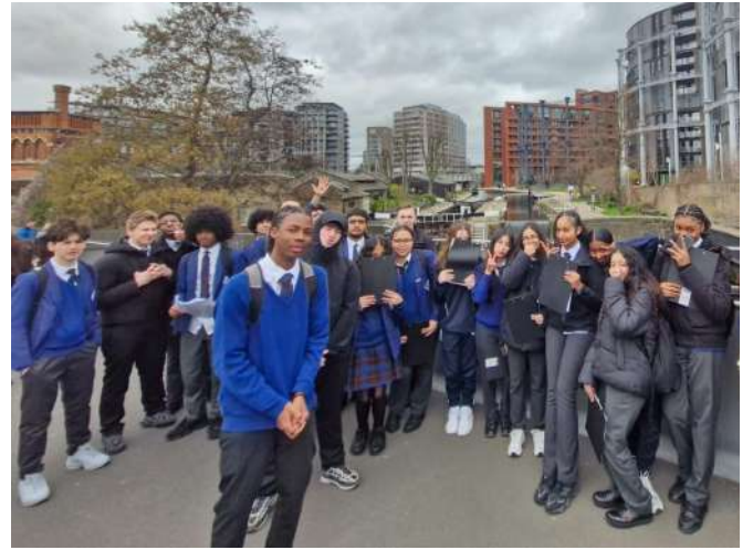
February: GCSE Geography Fieldtrip