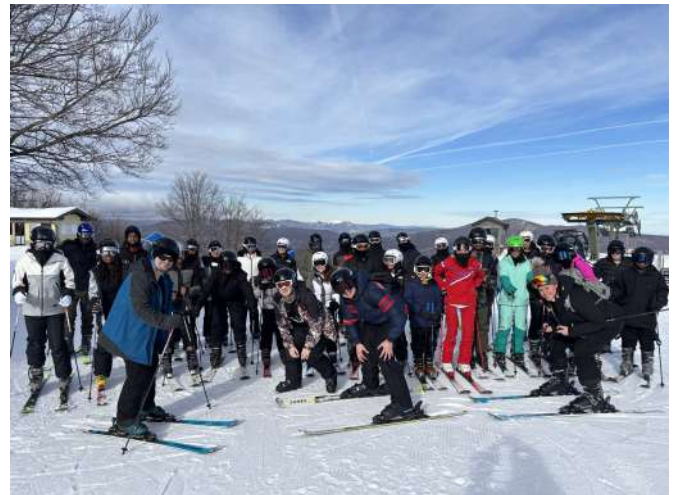
February: Ski Trip 2026