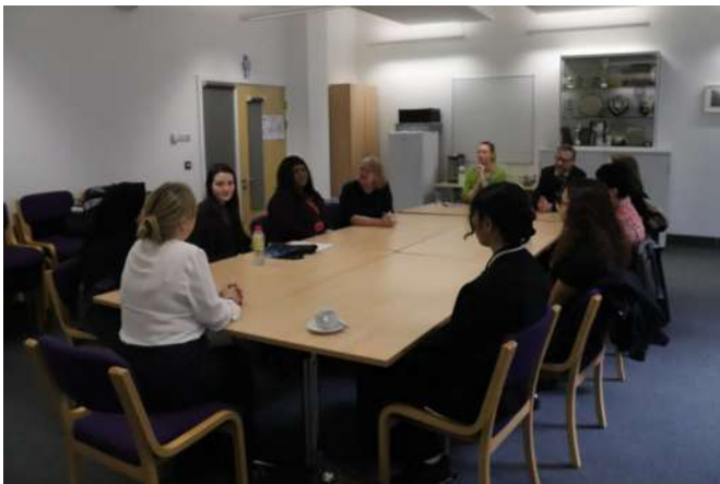
March: Deputy Mayor of London's Visit