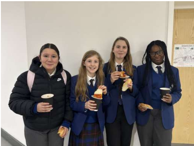
February: CAFOD Soup Lunch