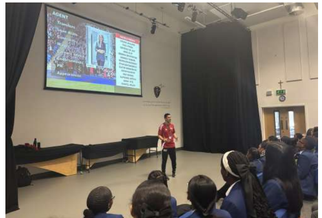
March: Mingalaba UK Languages Assembly