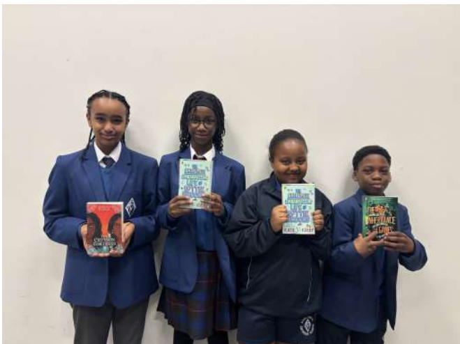
March: Year 7 Reading Champions