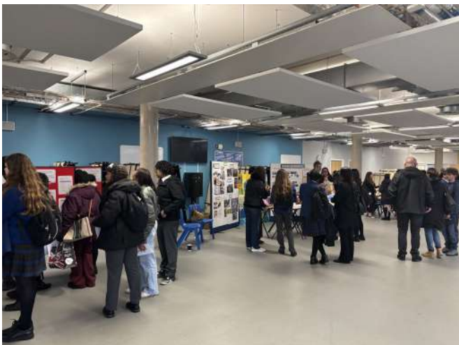
February: Year 8 Options Evening