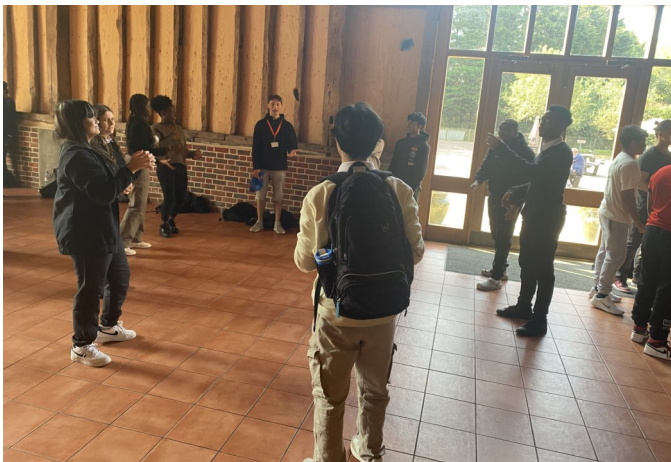
September: 6th Form Retreat to Aylesford