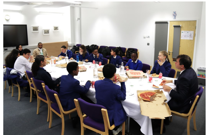
October: Headteacher's lunch