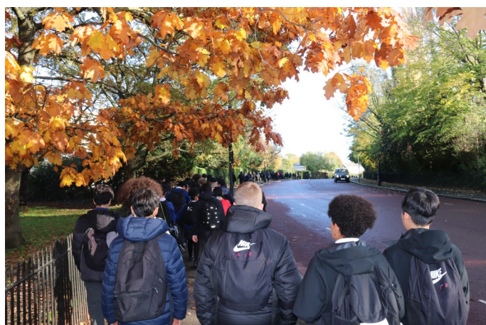
November: Sponsored Walk