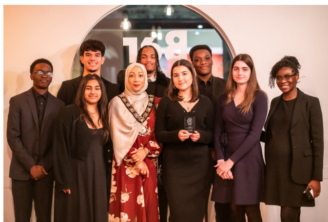
November: Eco-Champions Award