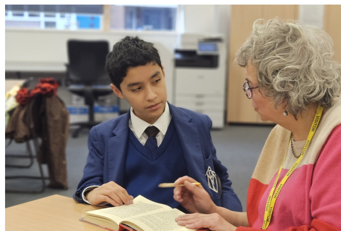
December: Senior Citizens Reading Project