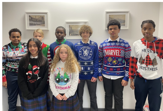
December: Christmas Jumper Day