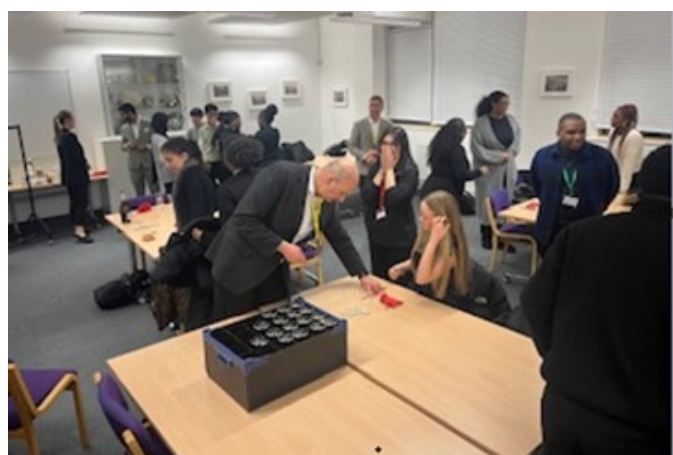
December: Silver-service training for the 6th Formers