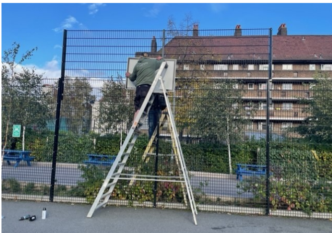
November: New Goalposts and basketball hoops installed in the MUGA