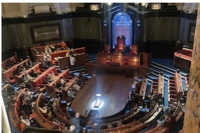
November: Drama Trip to Witness for the Prosecution