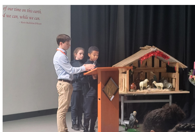
December: Carol Concert