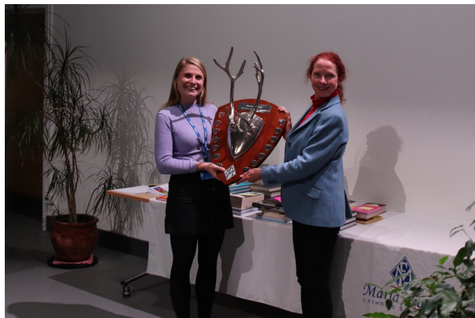
November: Prizegiving Ceremony