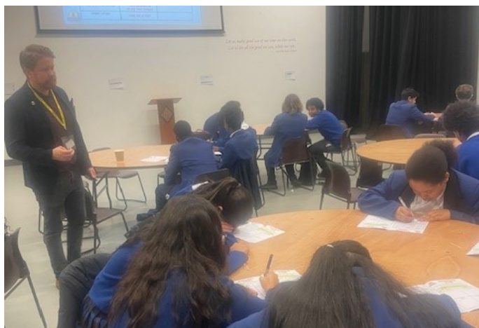
November: Year 11 Study Skills Talk