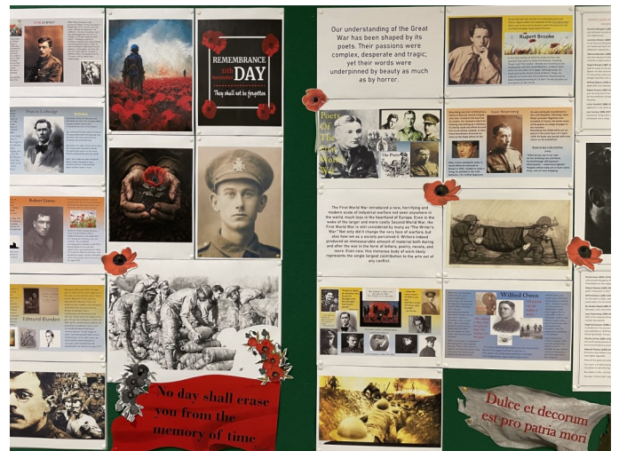
November: Remembrance Day