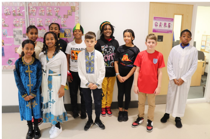
November: Cultural Day