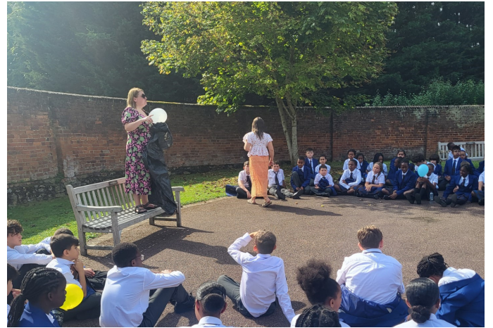
September: Yr7 Retreat to Aylesford