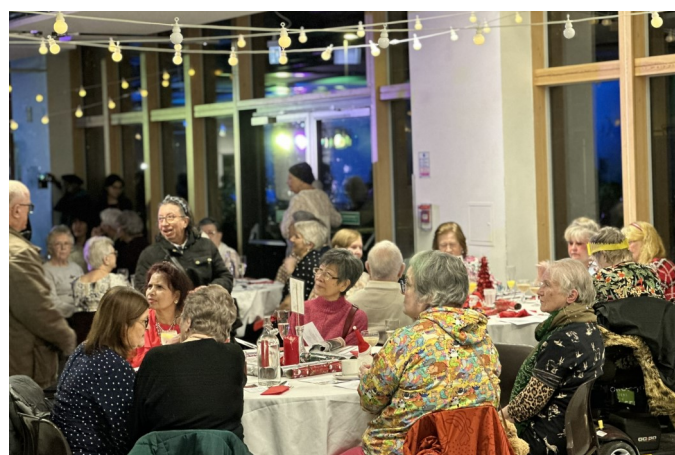
December: Pensioners' Party